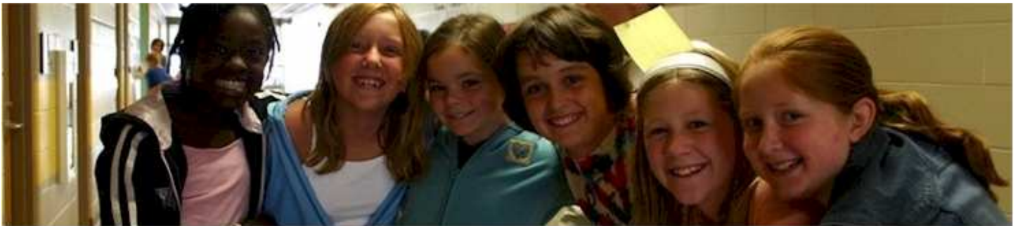
Northpoint Elementary School 2009